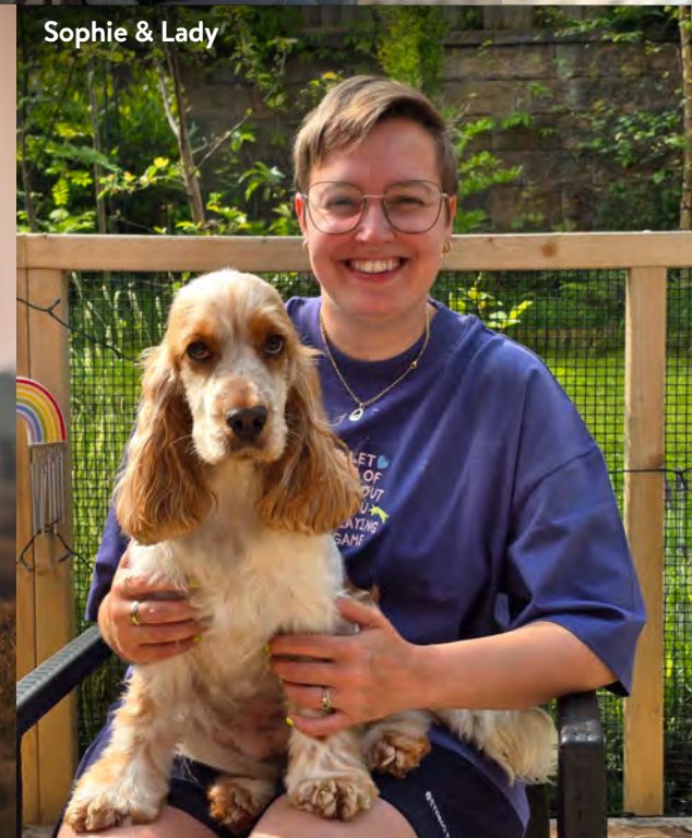
Sophie & Lady